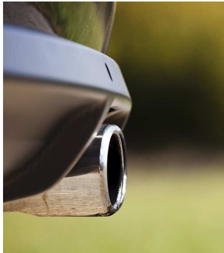
This technology could be used to measure carbon dioxide levels in an engine's exhaust