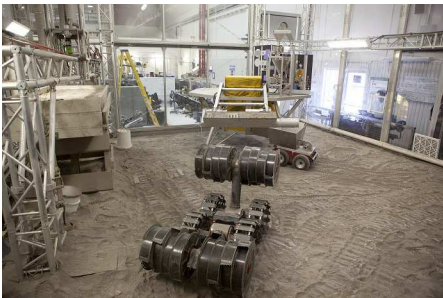
RASSOR 2.0 In Swamp Works Regolith Bin

During loading, the bucket drums excavate soil/regolith by scoops mounted on the drums exteriors that sequentially take multiple cuts of soil/regolith while rotating at approximately 20 revolutions per minute. During hauling, the bucket drums are raised by rotating the arms to provide clearance above the surface being excavated. The mobility platform can then travel while the soil/regolith remains in the raised bucket drums. When the excavator reaches the dump location, the bucket drums are commanded to reverse their direction of rotation, which causes soil/regolith to be expelled out of each successive scoop. RASSOR has wireless control, telemetry, and onboard transmitting cameras, allowing for teleoperation with situational awareness. The unit can be programmed to operate autonomously for selected tasks.